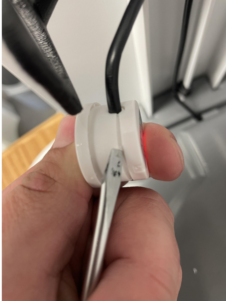
Sensor Back Remove with Screwdriver