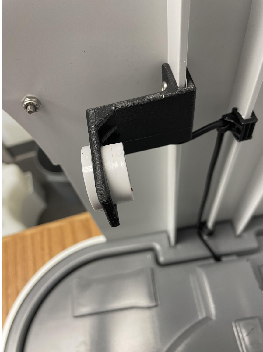
Sensor in Bracket