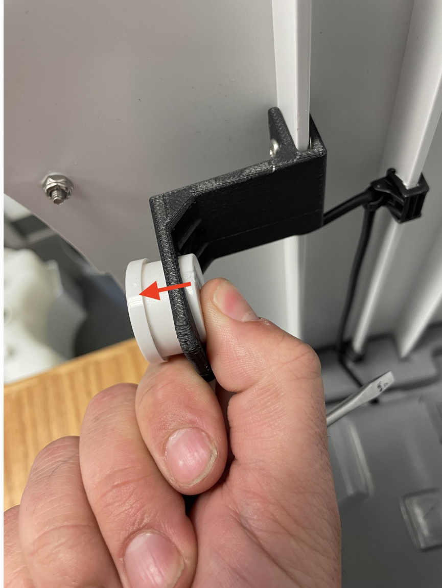
Sensor Remove from Bracket